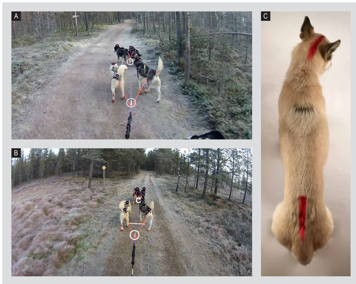
Figure 1. Gang-lines and dogs with markers highlighted. In the middle, the mainline is shown and in a different colour, the tug-lines attached to the dogs. The main line reflective markers circled in white, and dogs' markers emphasised with small black circles. (A) The traditional gang-line set up; (B) the stick gang-line; (C) the colour marks on a dog.

The dogs' work effort is related to the angle of pull. The angle of traction changes the amount of force needed to pull. The more parallel to the direction of the pull the line is, the less force is required to pull. As an example, to open a door with a rope, a dog needs to pull with 44.5 N if the rope is perpendicular to the door (i.e. 90 degrees angle to the door). The force demand rises to 97.9 N if the rope is at a 60° angle to the door (Coppinger et al. , 1998). In a study where a handler sitting in a wheelchair held the tow strap at the side of the wheelchair and instructed a dog to pull, the dog was actually observed to pull in a sideways direction, even though the dog was parallel to the direction of movement (Coppinger et al. , 1998).